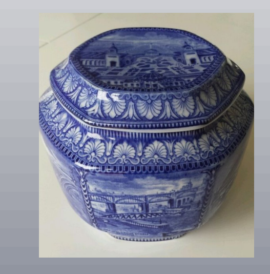
Ringtons tea caddy sold at Exhibition